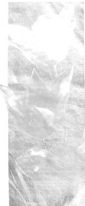
Cottage and Lily-flowered Tulips

We suggest that you plant your bulbs in groups, using only one variety to each group, in order to obtain the most pleasing effect. Dig a hole large enough to accommodate five or ten bulbs in a group. Set the bulbs in it, spaced 4 to 5 inches apart, and replace the soil.